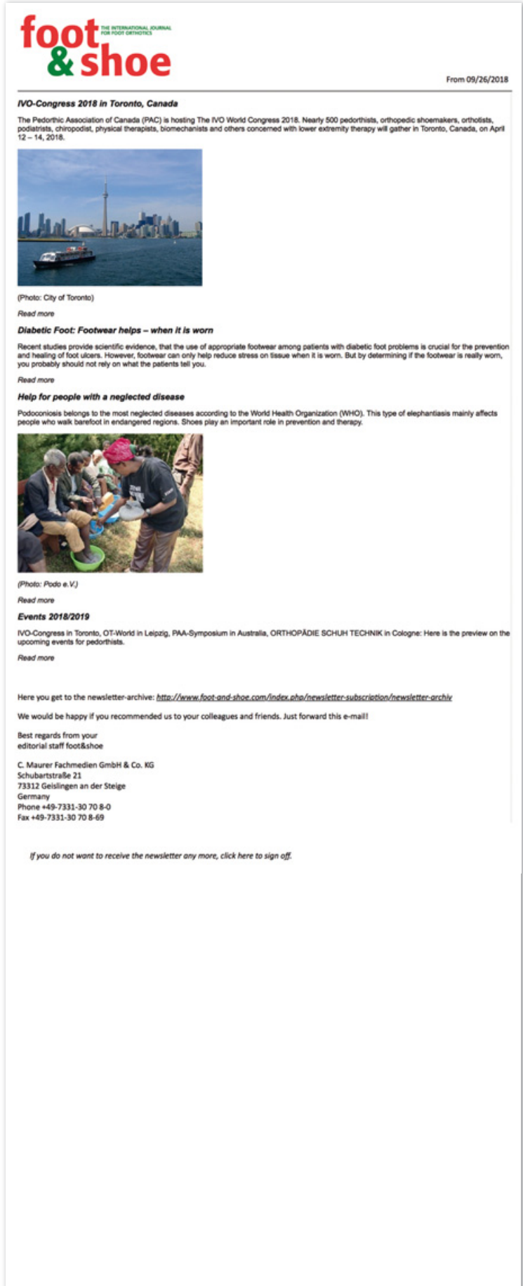
foot & shoe newsletter recipients October 2018

Circulation: 953 (Effective 14 August 2018)